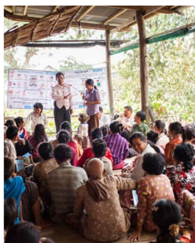
Happy Child project for mother and child, Siem Reap, Cambodia

Identified problems: Victims & PwD face important barriers to participate on an equal basis with other people in social & work life. | Main objectives: 1. To support the authorities in achieving their VA obligations as per the MBT & the Cartagena Action Plan. 2. To identify victims in the two most affected regions, and improve their access to social & livelihood services . | Activities: A) Policy: Enhance VA coordination by organizing multi-stakeholders workshops with the Ministry of Gender, Labor & Social Development. B) Personalized support: Provide individual support to enable victims to define needs & priorities and develop a plan to reach their goals. C) Access to services: Map health, psychosocial and livelihood services and support them to become accessible (awareness raising & training). Within social activities, a focus was given to sport & leisure activities, which was a priority for self-help groups. D) Empowerment: Support self-help groups to start & improve their capacities and activities related to sport & leisure (easy adaptations to sport & leisure rules and equipment to make them accessible).